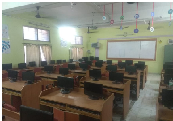
COMPUTER LAB. 1