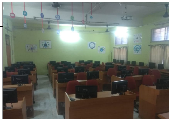
COMPUTER LAB. 2