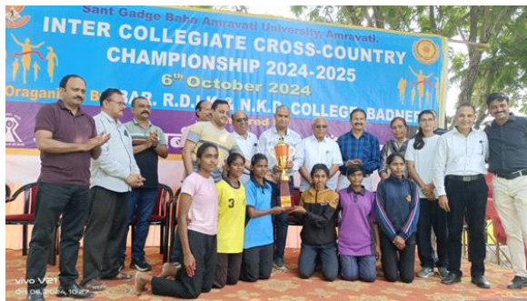
Cross Country (W)